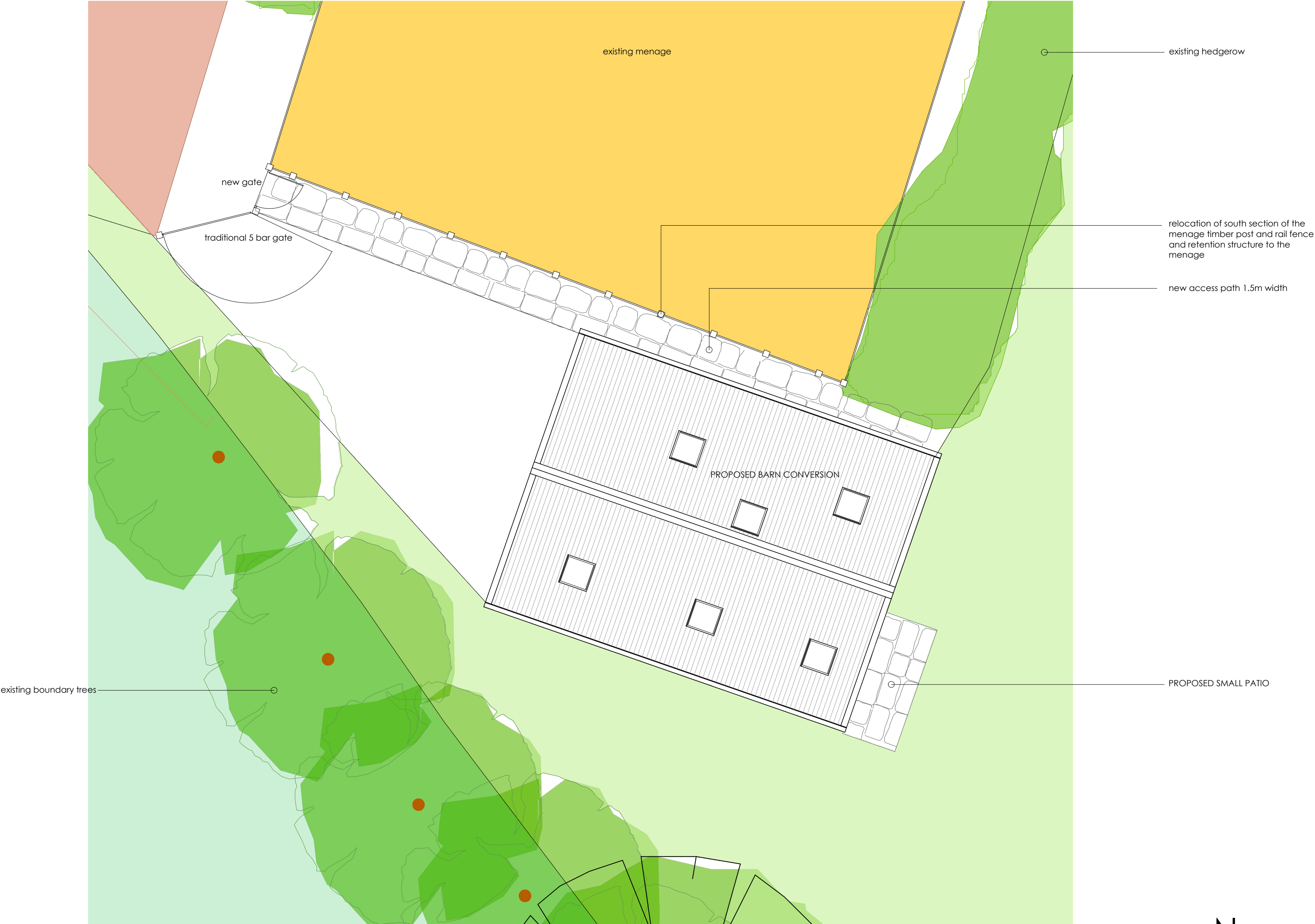
detailed site plan proposed scale 1:500